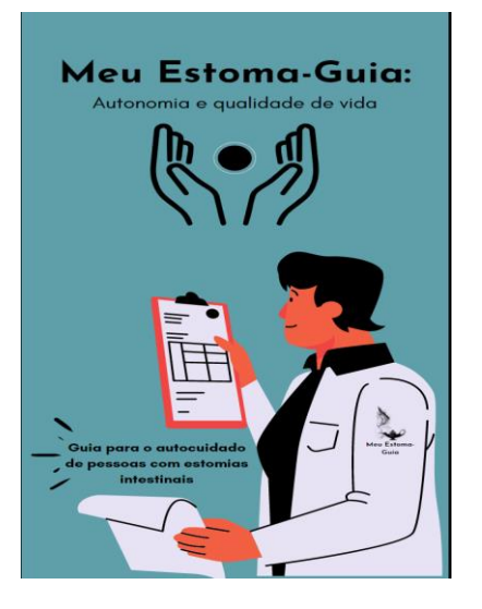
Figure 1 - Illustration of the cover version of educational technology. Niterói/Rio de Janeiro, Brazil, 2024.

The content was arranged in the same sequence as that emerging from the integrative review, classified by similarities and presented in